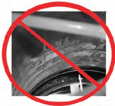
Improperly adjusted TXV

Suction temperature should be adjusted with use of an Evaporator Pressure Regulator (EPR). Models 2000 - 6000 Howe Flakers have an optimum suction temperature setting of between -5°F and -7°F. Model 1000 Howe Flaker has an optimum suction temperature setting of between 0°F and +2°F. These optimum suction temperature settings are to be checked and maintained at the flaker evaporator suction connection. They can vary slightly due to the effects of water temperatures, water hardness, ambient air temperatures and ice quality requirements.