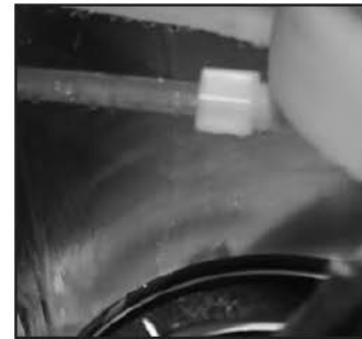
Properly adjusted TXV