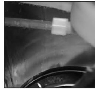
Properly adjusted TXV