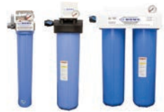
Filters and Accessories