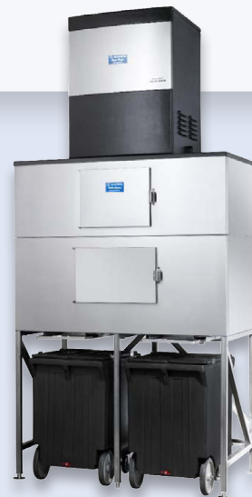
3000-RLE shown on CP2500 Mobile Express bin system. Storage bin system sold separately.